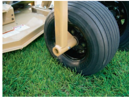
Gauge wheels feature bolt in spindles for ease of replacement, and 18" tires leaving a light weight footprint.